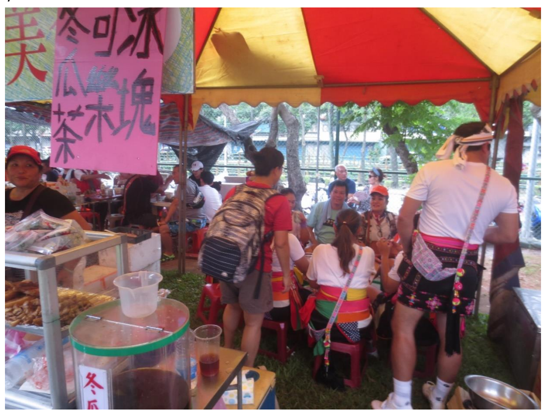
Photo 10 people enjoyed food at a vendor 2019-9-8